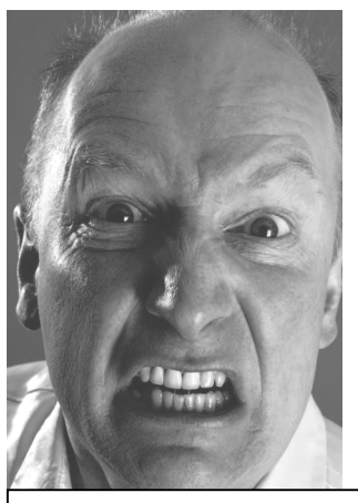
Signs of Math Anxiety: going blank, paranoia, tuning out, quilt, panic, and avoidance.

The good news is that you can overcome this fear of math. We have helped or watched many students conquer their fear of math and then conquer math.