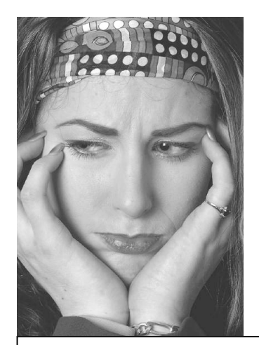
Pessimists tend to assume that the reason bad things happen are their fault and won't change.

Positive Self-talk. Self-talk is the talking you do in your own head about yourself and the things that happen. What you say to yourself can have a big effect on the way that you feel, and on what you can achieve. Positive self-talk can serve as an internal coach, encouraging you and boosting your confidence. Negative self-talk can destroy your best efforts and cause you to fail. Sports psychologists have long recognized the importance of positive self-talk in helping athletes achieve their potential. Positive self-talk is one tool that good athletes use.